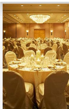
Venue: Park Hyatt, Goa

Bad thing (23%); Good thing (72%); Can't say (5%)